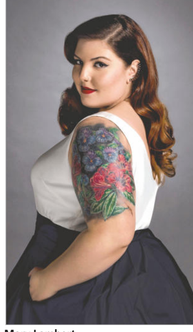
Mary Lambert

Mary Lambert, Lisa Loeb and NONONO are among the performers set to take the stage at the 2014 Nashville Pride Festival on June 13-14 at Public Square Park.